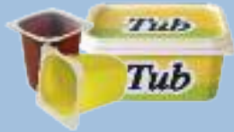
Plastic pots, tubs and food trays