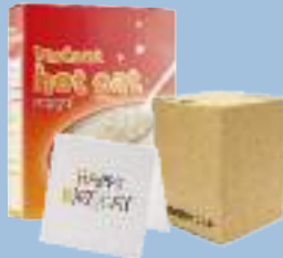
Cardboard, clean food packaging, boxes and cards