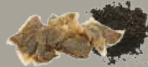
Tea and coffee