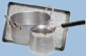
Metal pots, pans and trays