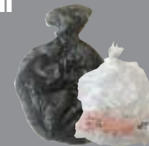
Carrier bags, black sacks, plastic film & wrappers

DOUBLE BAG FOOD WASTE & NAPPIES TO REDUCE ODOURS