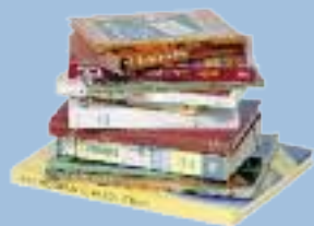
Books, paperback and hardback