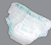
Nappies & Sanitary