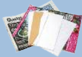
Paper, newspapers, magazines and junk mail

CLEAN, DRY & LOOSE NO BAGGED ITEMS NO GLASS NO FOOD