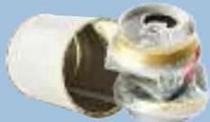
Steel and aluminium cans