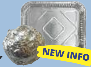
Aluminium foil (ROLL YOUR FOIL INTO A TENNIS BALL SIZE)