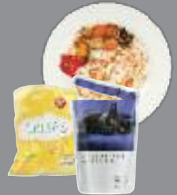
Food waste, crisp packets and food pouches

Keeping the lid closed will reduce odour from your bin. Only use the bin for your waste, additional rubbish will not be collected.