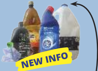
Plastic bottles and tops (WASH, SQUASH AND PUT THE TOP BACK ON)