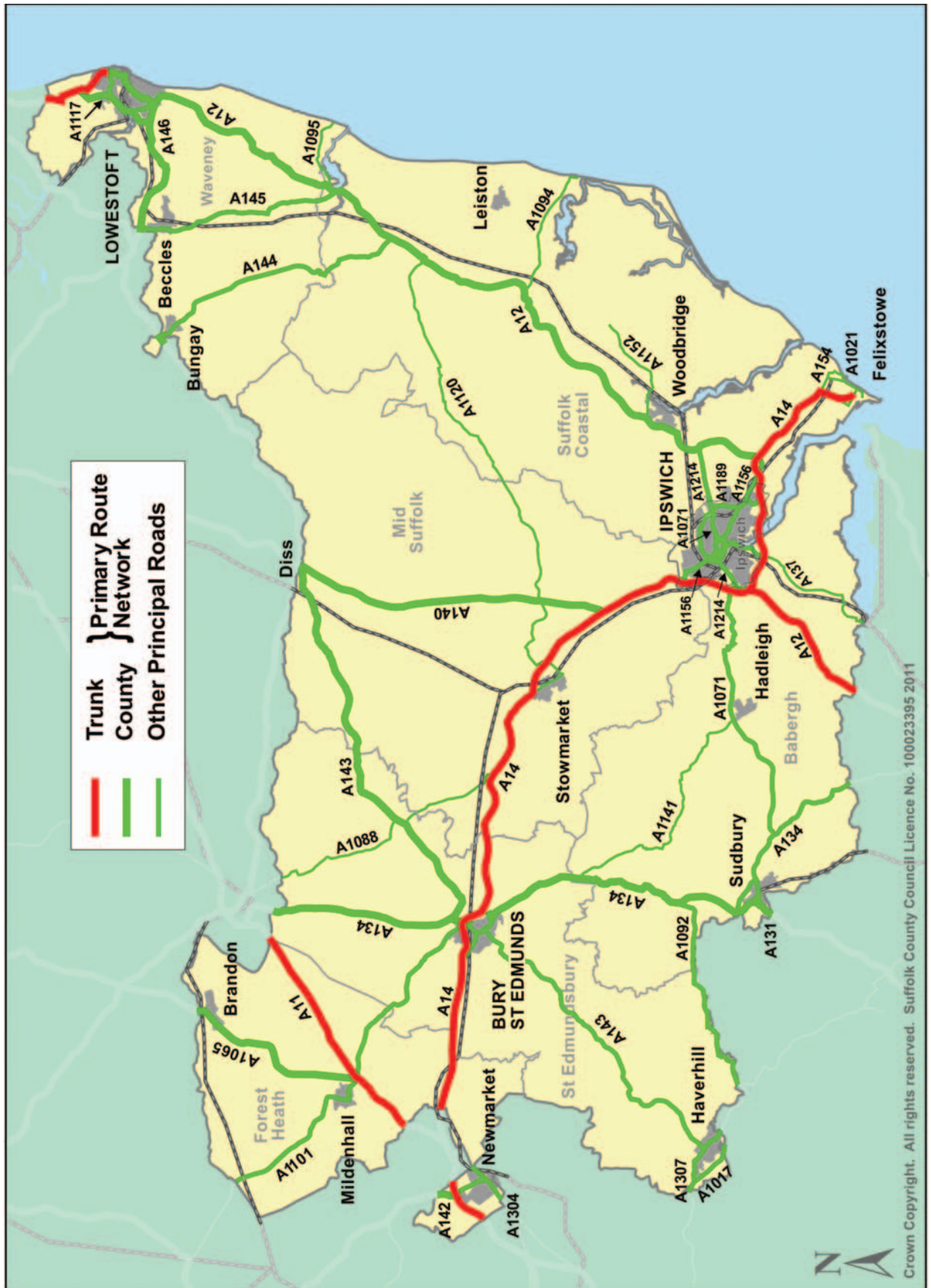
Figure 2 - Suffolk's principal transport network