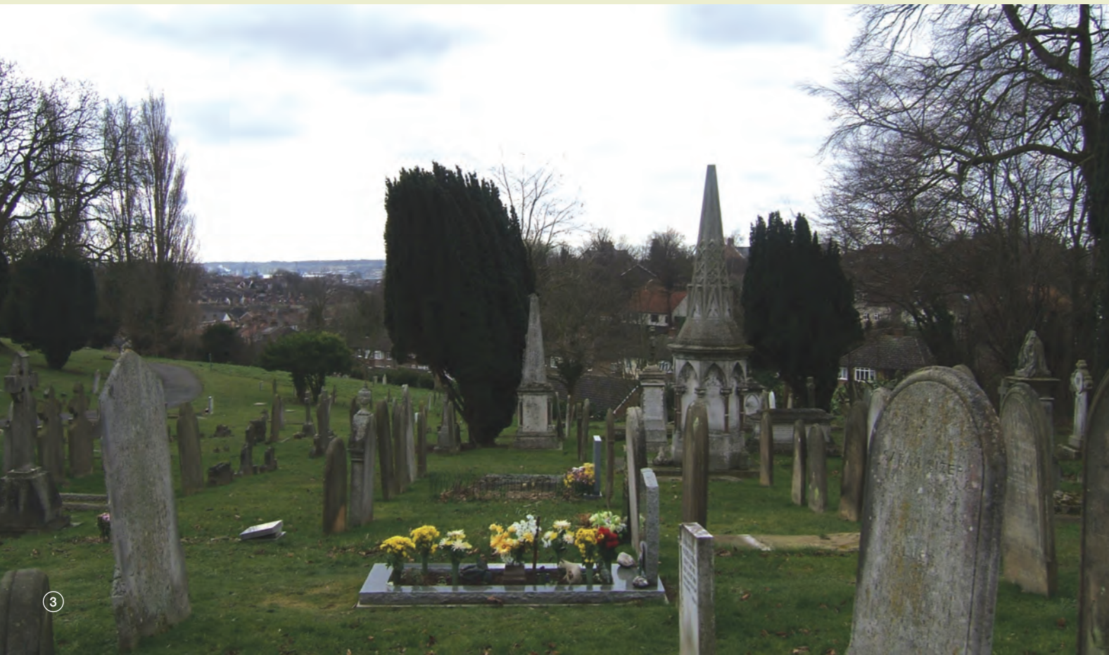
view of the Old Cemetery

The area contains three Grade II Listed buildings: the Anglican and Non-Conformist chapels built in 1855 and the Temple of Remembrance built in 1935 together with other buildings, several of local interest. The chapel designs stemmed from an architectural competition for the layout of the burial ground and was won by London architects Cooper and Peck.