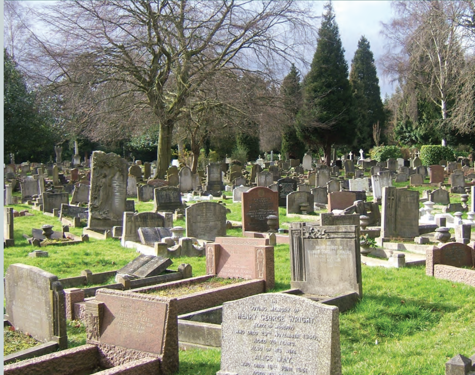
The New Cemetery

Like the Old Cemetery the New Cemetery is also enclosed by a perimeter of mature trees. On entering the New Cemetery from the north the main curving drive, lined with mature trees, is flanked by small hedged enclosures containing graves. The drive leads south-west to the Crematorium, beside which stands the Temple of Remembrance. The Temple overlooks a small formal garden containing a pool and is divided into 12 sections reflecting each month of the year. On the south side of the Crematorium the grounds divide into two distinct characters. From the Crematorium a wide formal drive lined with dense shrub planting runs south-west and is flanked by areas of grass set graves and enclosed by curved paths planted with mature broadleaved and coniferous trees. Between this area and the south boundary of the New Cemetery on Belvedere Road the ground is laid to an informal plan, densely planted with a wide variety of large trees and shrubs and cut through with meandering paths past the headstones.