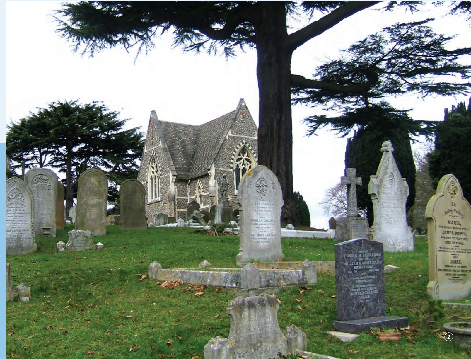
Non-Conformist Chapel in the Old Cemetery

This statement is intended as supplementary planning guidance to the Ipswich Local Plan as set out in paragraph 4.73. This statement describes briefly the purpose in declaring the area as a conservation area; sets out in detail the special character of the area; the particular supplementary policies to apply within the area to protect its special status; and specific measures for its protection and enhancement as required under Section 72 of the Planning (Listed Buildings & Conservation Areas) Act 1990 and as advised by the Departments of National Heritage and Environment Planning Policy Guidance Note [PPG]15: Planning and the Historic Environment.