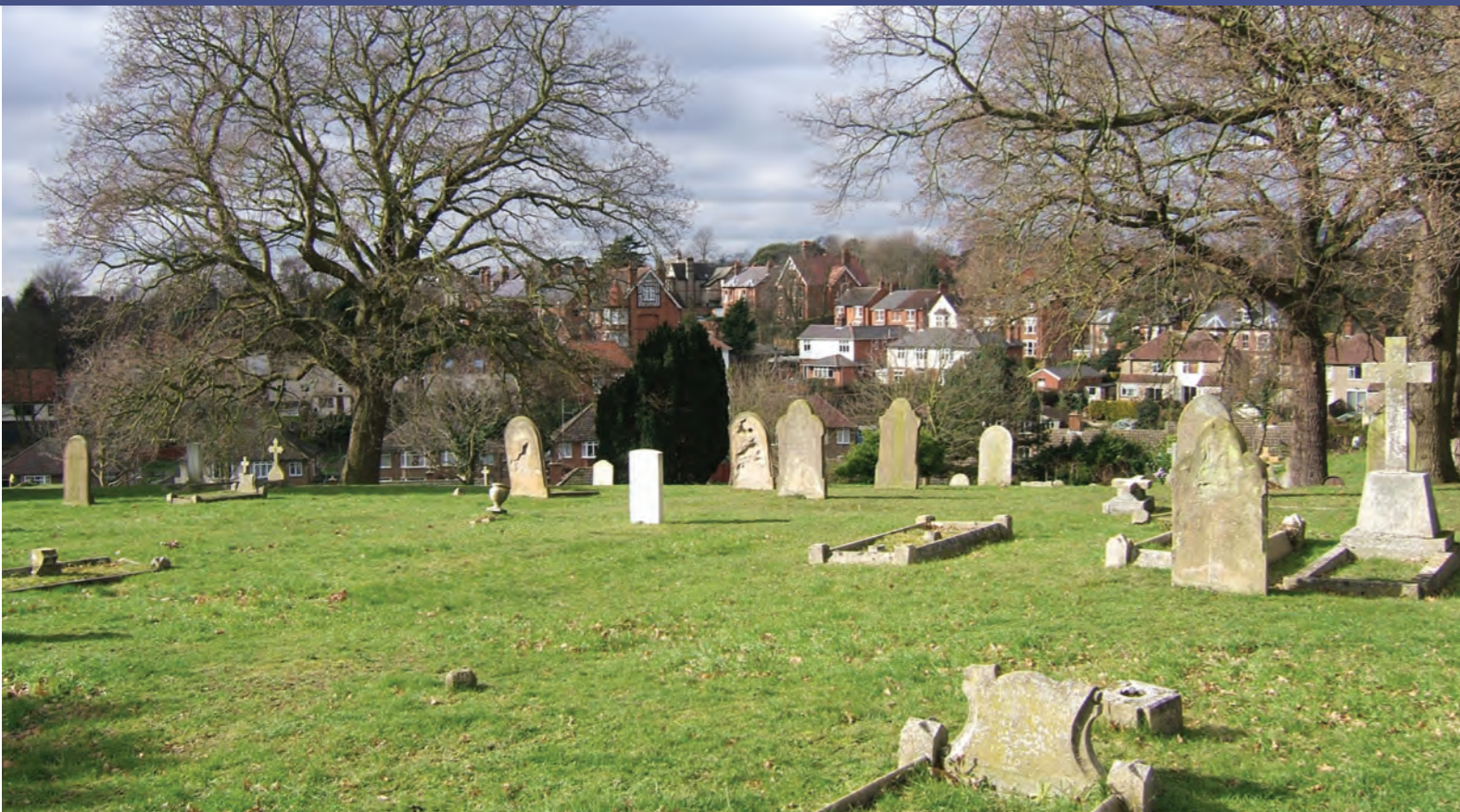
The Old Cemetery

the New Cemetery is generally level; it is more undulating in the Old Cemetery particularly along the eastern boundary and to the south of the chapels which sit on high ground. This change in level gives panoramic views across the town to the south-west.