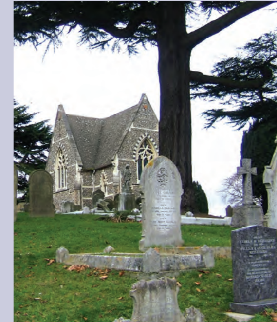
Left: Non-Conformist Chapel Below: Temple of Remembrance

The Old and New Cemetery contain some original cemetery furniture such as the cast iron water taps some complete with their lead lined troughs for collecting water.