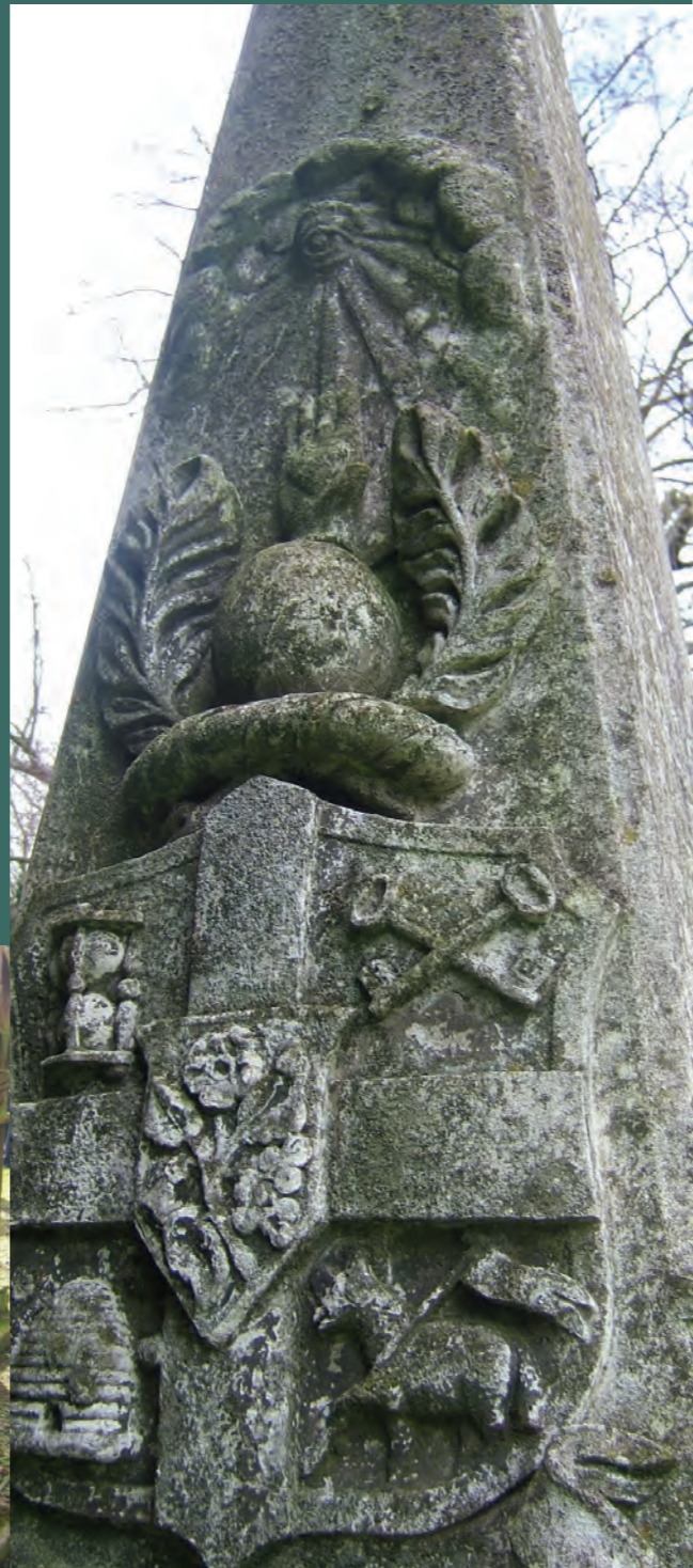
Right: An example of an ornately carved obelisk Below: Original railings surrounding a plot

Until the mid 19th century the majority of gravestones, crosses and slabs were made from local stone which could be easily worked and sculpted and did not involve costly transportation over large distances. With the development of improved transport networks, imports of materials such as granite and marble began to increase. These stones were also perceived to be more durable and therefore more appropriate for use in exposed situations such as graveyards. This change in materials has greatly altered the character of cemeteries and is evident in the change of materials from predominately limestone in the Old Cemetery through to almost completely polished marble and granite in the Lawn Garden.