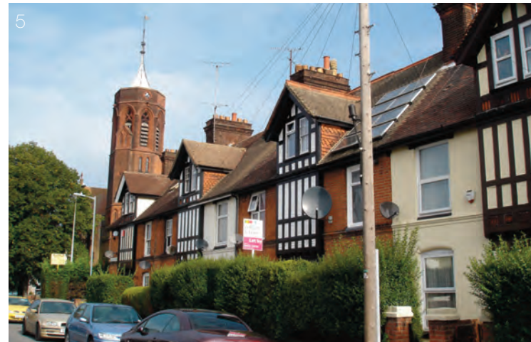
1 The Crescent, London Road. This imposing terrace is in a transitional style between the classicism of the earlier 19th century and the more picturesque style of the Victorian period.