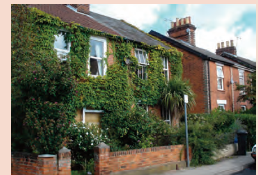
Dillwyn Street West.

In addition, opportunities for enhancing the biodiversity value of homes and gardens should be promoted, e.g. Swift and Bat features, wildlife-friendly planting, fencing with gaps for hedgehogs and so on.