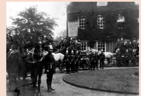
Picture: Brooks Hall, c.1910. This historic house survived until after the first world war, when the site was cleared to make way for Valley Road. Ipswich Town FC played in open fields near the house until 1878/88 when the club moved to the Portman Road site. The Inkerman pub provided changing facilities for the players. The firemen in the image may be part of a fund raising parade.

The arrival of the railway provided the impetus for the town's expansion in the second half of the 19th century, and the Norwich Road area is a particularly well preserved example of suburban housing constructed during this period.