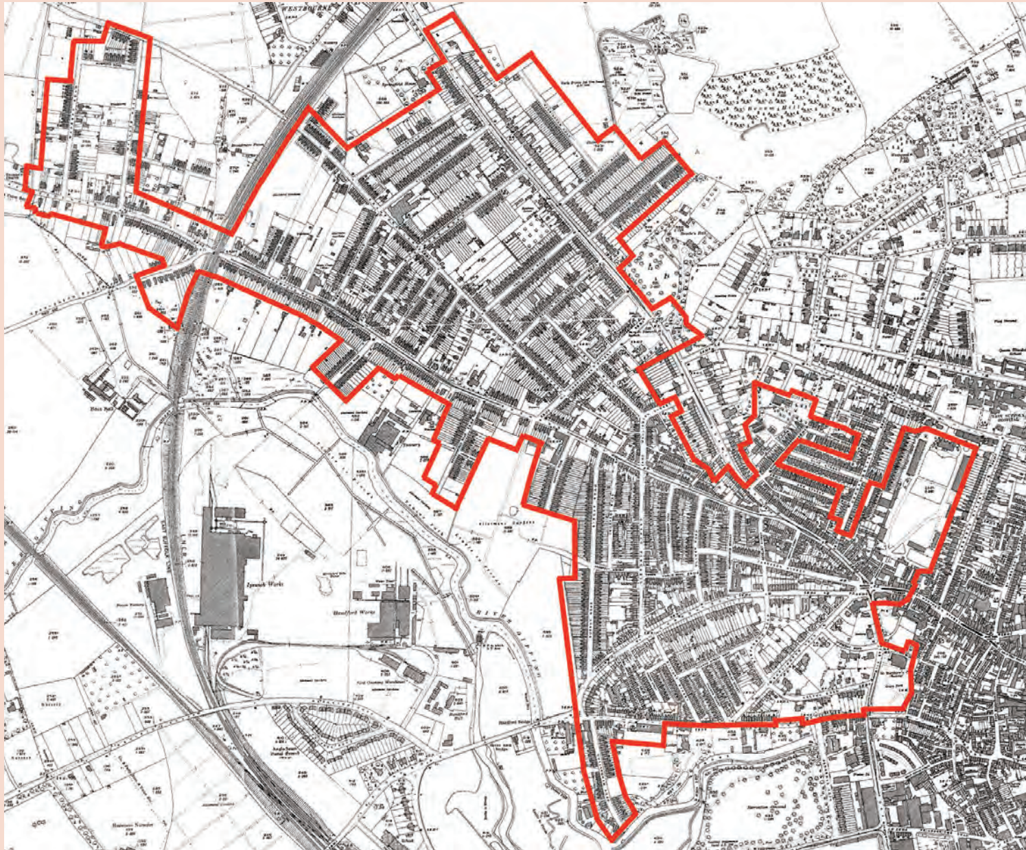
The Norwich Road area in 1926 (Ordnance Survey map)