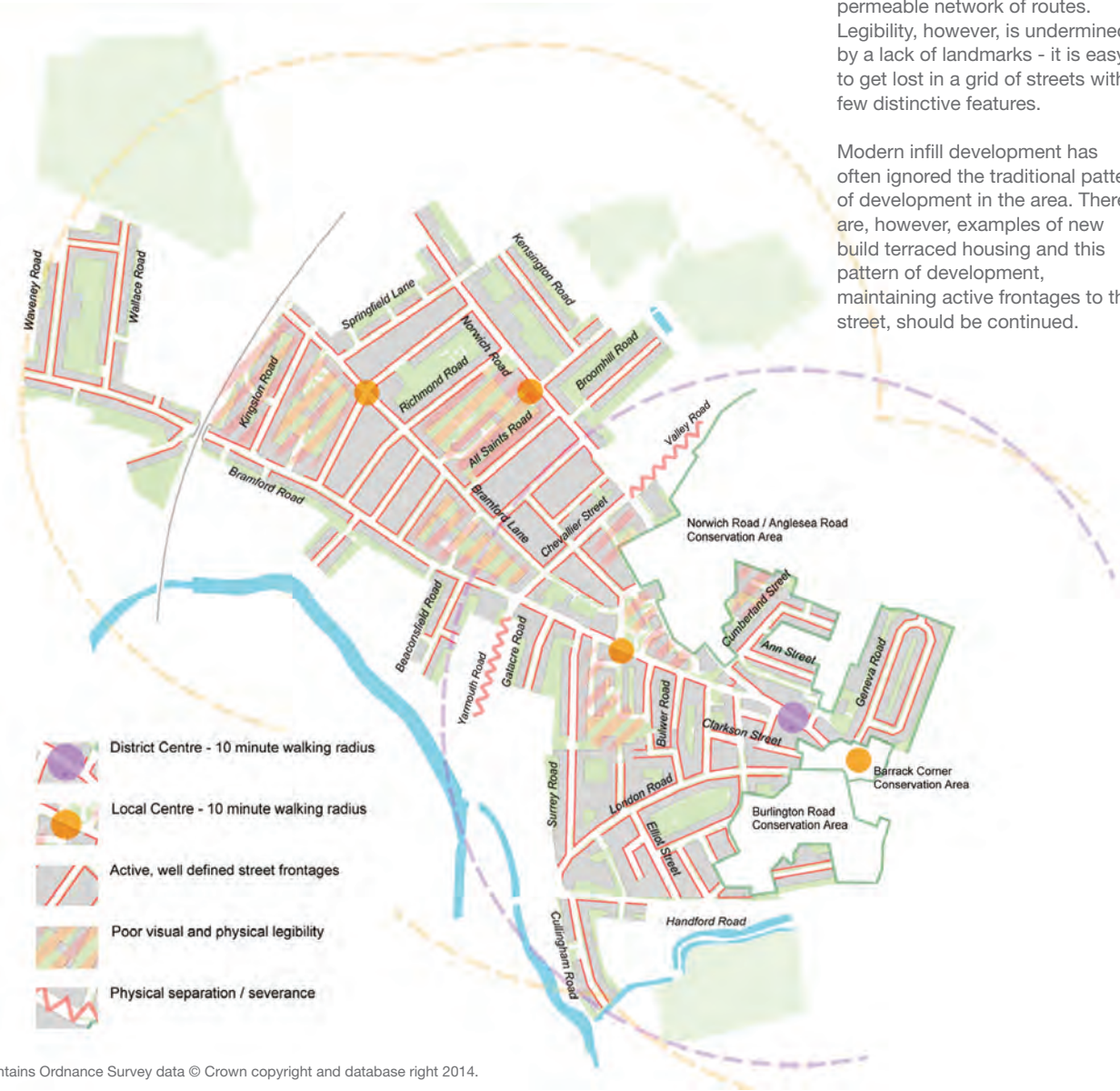
Contains Ordnance Survey data © Crown copyright and database right 2014.

The urban streetscape is defined by active frontages and a permeable network of routes. Legibility, however, is undermined by a lack of landmarks - it is easy to get lost in a grid of streets with few distinctive features.