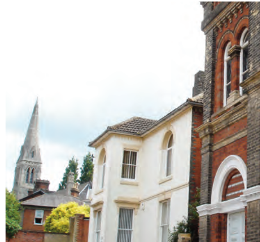
Barrack Lane. Gatepost with inscription and ball finial, 19th century. This is a surviving part of the wall enclosing the former cavalry barracks. The site is now occupied by housing.