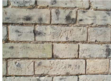
The transition to the decorative Victorian style of building can be traced in the building materials, from Suffolk White brick in Clarkson Street to the ornamental use of 'rustic' materials such as flint cobbles. This eclectic mix can be reflected in the design of modern development, though deliberate contrast has to be balanced by careful scaling and detail.

The transition to the style of the later Victorian period is visible in the housing further down London Road. Still targeting an upper middle class market, these houses make use of bay windows, decorative gables and dormers and mixed construction materials; red brick with stone dressings, red brick and terracotta, red brick and flint. It is important that these early suburbs are conserved and protected as far as possible from demolition and unsympathetic alteration.