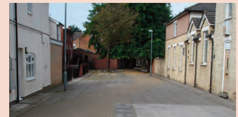
Prospect Street. Selective road closures can create pedestrian friendly areas, though they also tend to reduce legibility and permeability.