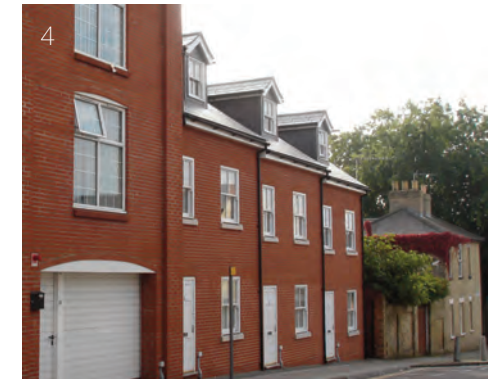
1 County Records Office, Gatacre Road. Formerly Bramford Road Board School, built in 1888, this landmark building has been adapted to house the County Records Office and Sir John Mills theatre. The modern buildings are large but sensitively integrated into the site.