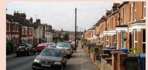
Broom Hill Road. Well proportioned streets and clear sightlines are a feature of the area.

The pedestrian and cycle environment is less successful, partly because of the busy traffic environment and the lack of width on primary routes. The riverside cycle path provides an alternative route westwards from the town centre, but on-road facilities (particularly along Norwich Road) require further improvement.