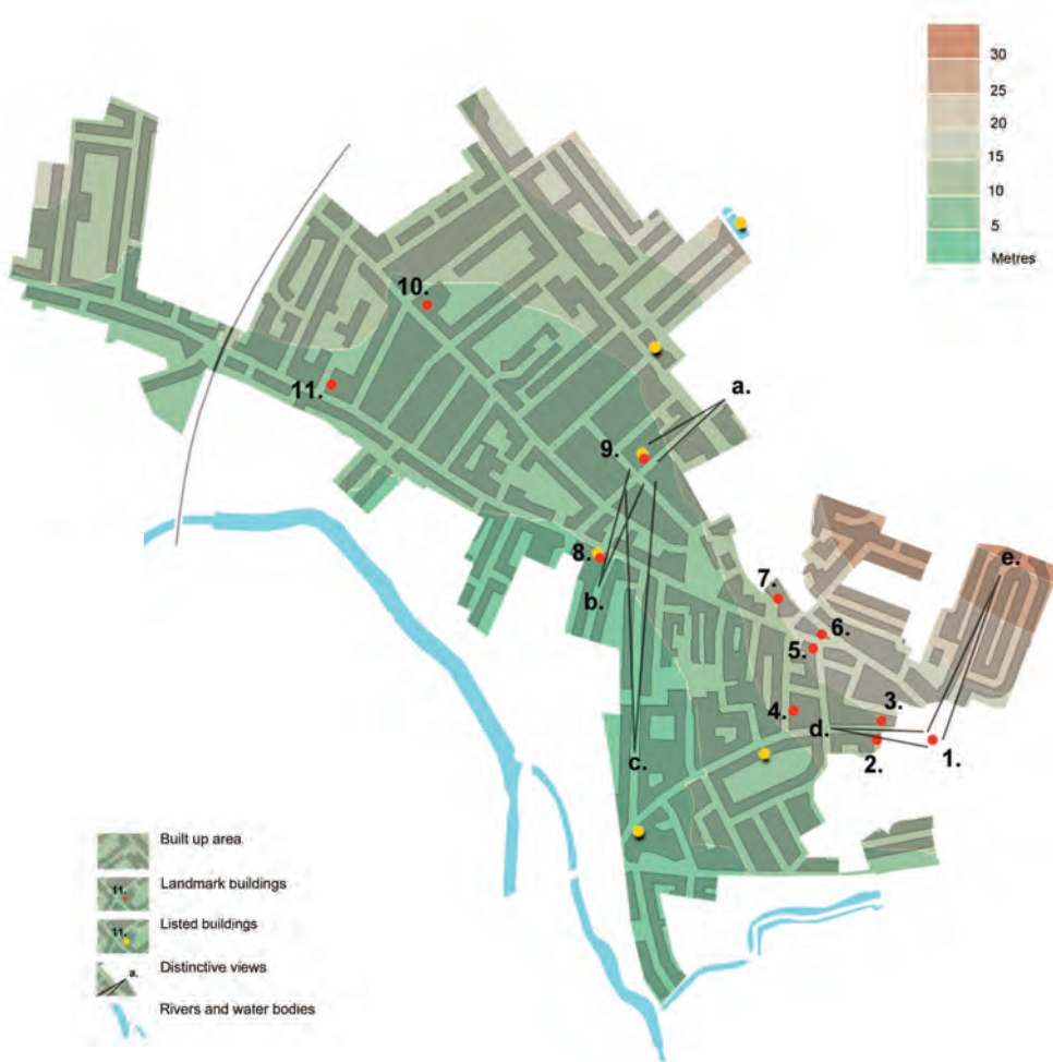
Contains Ordnance Survey data © Crown copyright and database right 2014.