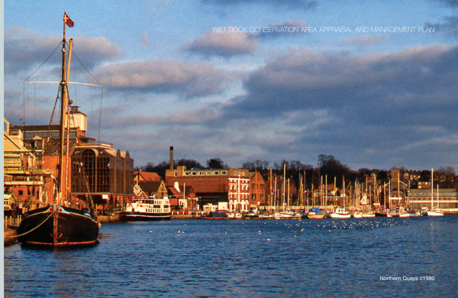
Northern Quays c1980