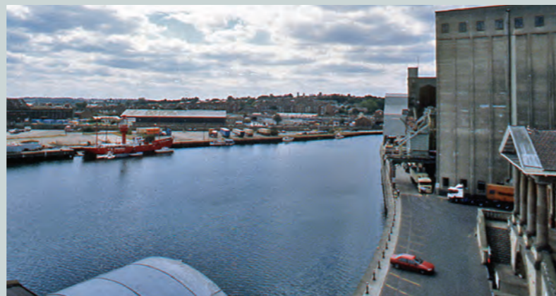
Wet Dock before redevelopment

Wet Dock Conservation area; the Central Conservation Area close by and to hinterland behind, but influential to the setting of the Wet Dock conservation Area as a consequence of realising the considerable potential for comprehensive, non-port related development. It was considered that the features that give this area its special character should be safeguarded and, through investment from comprehensive development the public realm should be enhanced.