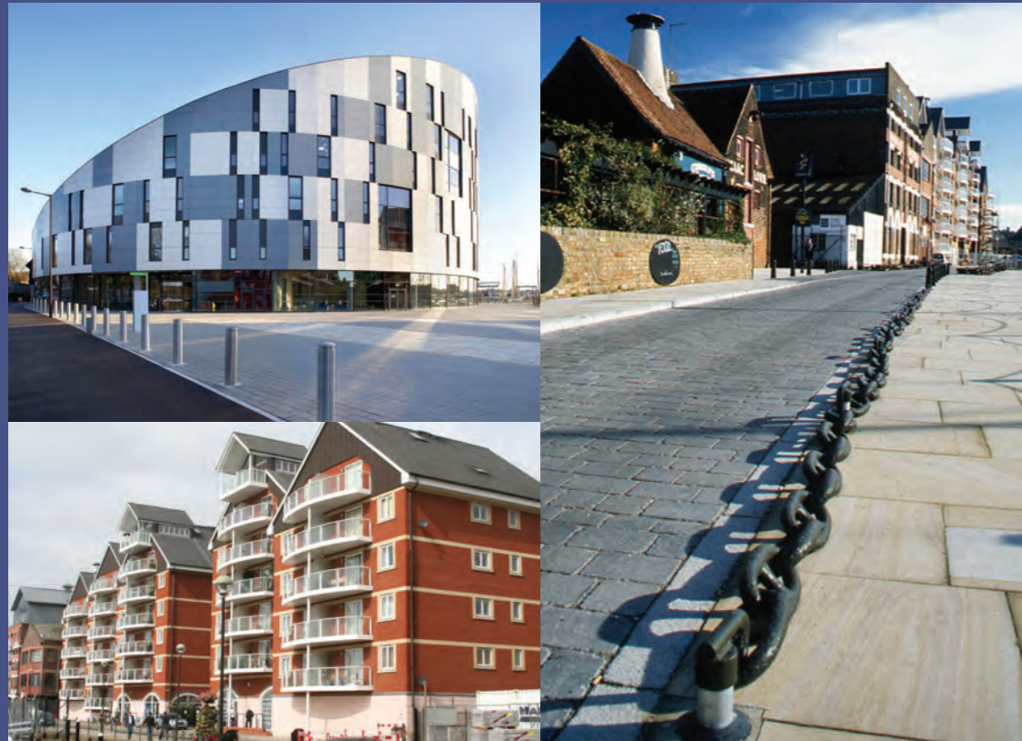
Clockwise from left: University Campus Suffolk Neptune Quay Northern Quays

Built in 2008-9 it has an unusual form and unique cladding which create a dramatic point at the corner of the dock and an easily recognisable landmark in views around the dock despite not being conspicuously tall.