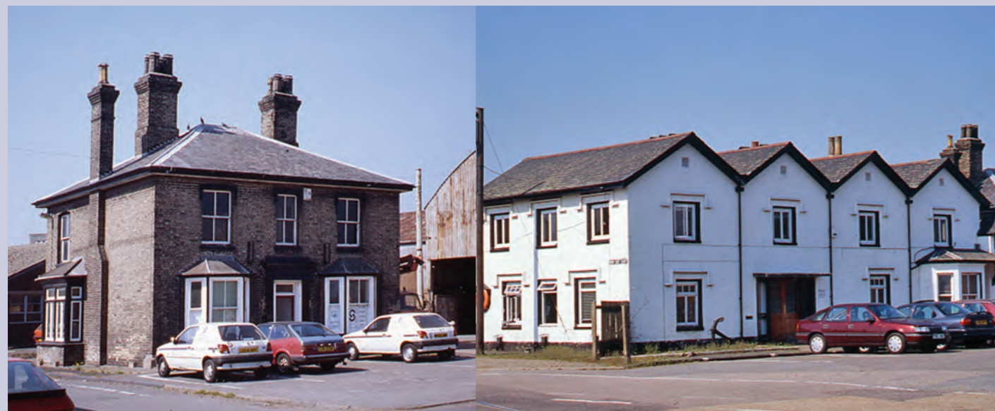
Above: Dock Crane Below: Harbour Masters House and Lock Keepers Cottages

to this part of the Island Site and are worthy of retention. There are no other features of interest and no evidence survives of the pleasure grounds of the 19th Century.