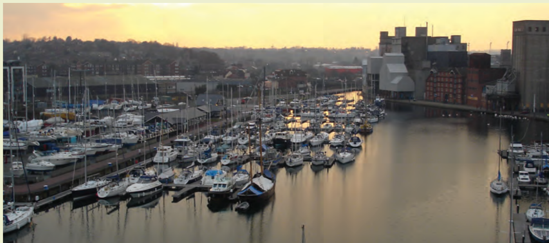
Clockwise from right: Albion Mill before development Cranfield Mill Neptune Quay Wet Dock 1990s