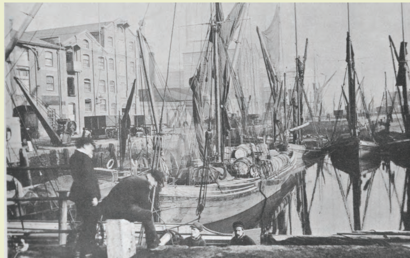
Victorian quayside Northern quays paving

In the 19th Century, the Island Site was a popular place for public recreation. Along each side of the New Cut, south of the original lock entrance an avenue of trees had been planted, adding to the beauty of the walks and according to popular guide book accounts, 'on summer evenings hundreds of the towns-people would enjoy the sea-breezes, the lively sights of the vessels and the steamers coming and going and the pleasure boats on the water'. Gravelled walks were laid out and many seats were provided under the "umbrageous" trees. At the southern end adjacent to the relocated lock-gates, a circular shelter known as the "Umbrella" was erected from which the best views of the river could be obtained. This was also occasionally used as a bandstand. The unnamed writer in 1890 stated that all these features 'speak well for the public-spiritedness of Ipswich' and 'strike a stranger as peculiarly attractive'.