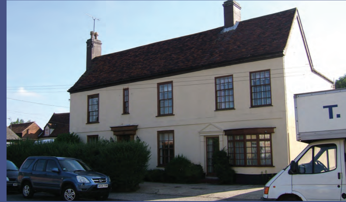
Left: Nos 720 Old Norwich Road