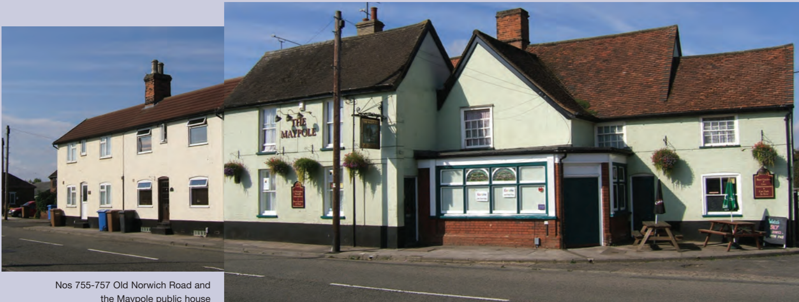
Nos 755-757 Old Norwich Road and the Maypole public house