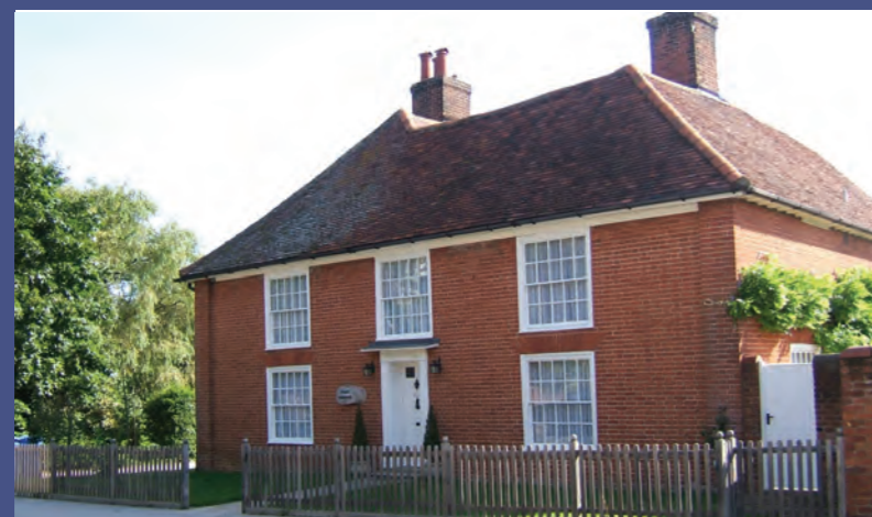
No 728 Street Farmhouse, Old Norwich Road

No. 726 'Fairmead' (Listed Grade II) is an attractive early 19th Century red brick, slate roofed two-storey house. A slightly projecting wing with a hipped slate roof was added later in the 19th Century on the northern side. The house has sash windows with glazing bars in gauged arched openings and a central stuccoed Tuscan porch with plain columns projecting on the front. The window opening above is blocked. The tall chimney stack adds to the skyline interest. The front boundary railings are modern with the exception of a small section with the original Victorian cast-iron heads at the corner with the lane. The red brick side boundary wall to Whitton Church Lane, is important in confining the narrow view within the lane to the buildings on either side thereby camouflaging the encroachment of the urban development to the east.