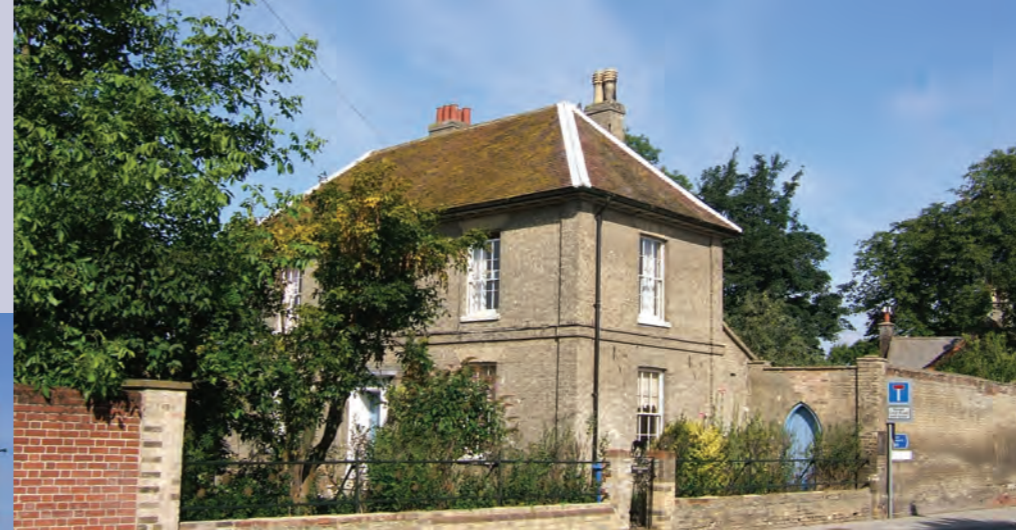
No 785 Corporation Farmhouse Old Norwich Road