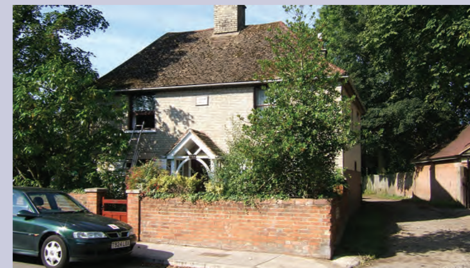
No 786 Lilburne Lodge Old Norwich Road

The front garden planting contributes to the landscape character of the street while also screening to some degree the farm outbuildings to the west. The wall is lower as the corner of the house is approached affording a pleasant oblique view of the front from the street. The rear garden, parallel with the road, is totally secluded behind a very tall, part white brick, part red brick wall. The house also serves to enclose the attractive westward view from the narrow, winding Whitton Church Lane immediately opposite its east elevation.