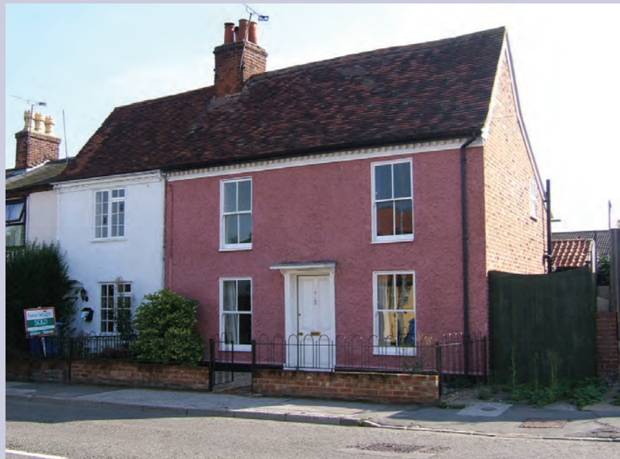
Below: Nos 712-714 Old Norwich Road