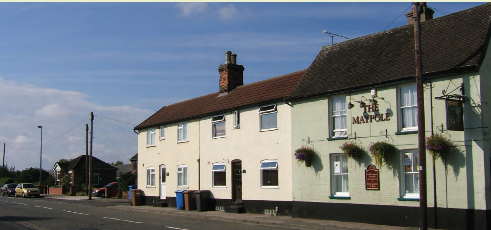
Old Norwich Road

The conservation area designated in March 1990 is bisected by Old Norwich Road. This was formerly a quite narrow road with most properties being set back only slightly from the pavement. It became a very heavily used principal trunk route in the post-war period before being bypassed in the 1980s. It is now a bus priority route with only through local traffic using the narrow Whitton Church Lane. With the removal of heavy traffic, the village street atmosphere has returned to some extent.