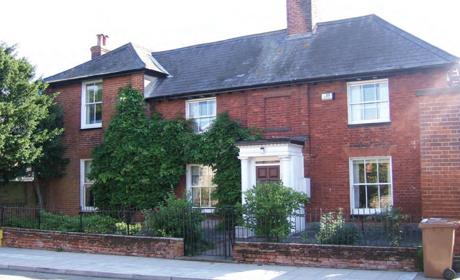
No 726 Fairmead Old Norwich Road

No. 726 'Fairmead' (Listed Grade II) is an attractive early 19th Century red brick, slate roofed two-storey house. A slightly projecting wing with a hipped slate roof was added later in the 19th Century on the northern side. The house has sash windows with glazing bars in gauged arched openings and a central stuccoed Tuscan porch with plain columns projecting on the front. The window opening above is blocked. The tall chimney stack adds to the skyline interest. The front boundary railings are modern with the exception of a small section with the original Victorian cast-iron heads at the corner with the lane. The red brick side boundary wall to Whitton Church Lane, is important in confining the narrow view within the lane to the buildings on either side thereby camouflaging the encroachment of the urban development to the east.