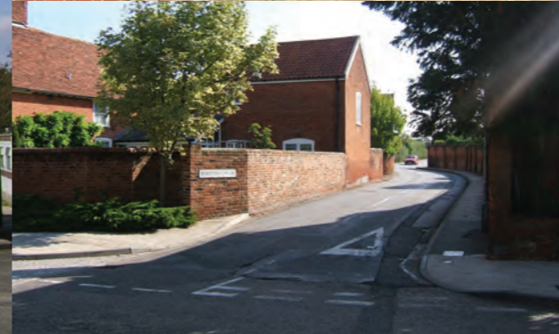
Whitton Church Lane

To the north of Corporation Farmhouse is No.789 'Lilburne Lodge' also a building of special local architectural interest. This small early 19th Century Suffolk white brick house with a central chimney stack, clay plain tile roof and four-light sash windows is a good example of the formal vernacular architecture of the area. The Edwardian porch to the central front door adds a note of distinction to the design. To the north side boundary, Whitton Lane leads to the farm entrance to Corporation Farm. The narrow curving unsurfaced lane emphasises the semi-rural character of the area and this is reinforced by the trees which overhang it (located in the large garden of No.795 on the northern side) and foreshortens the view out of the area.