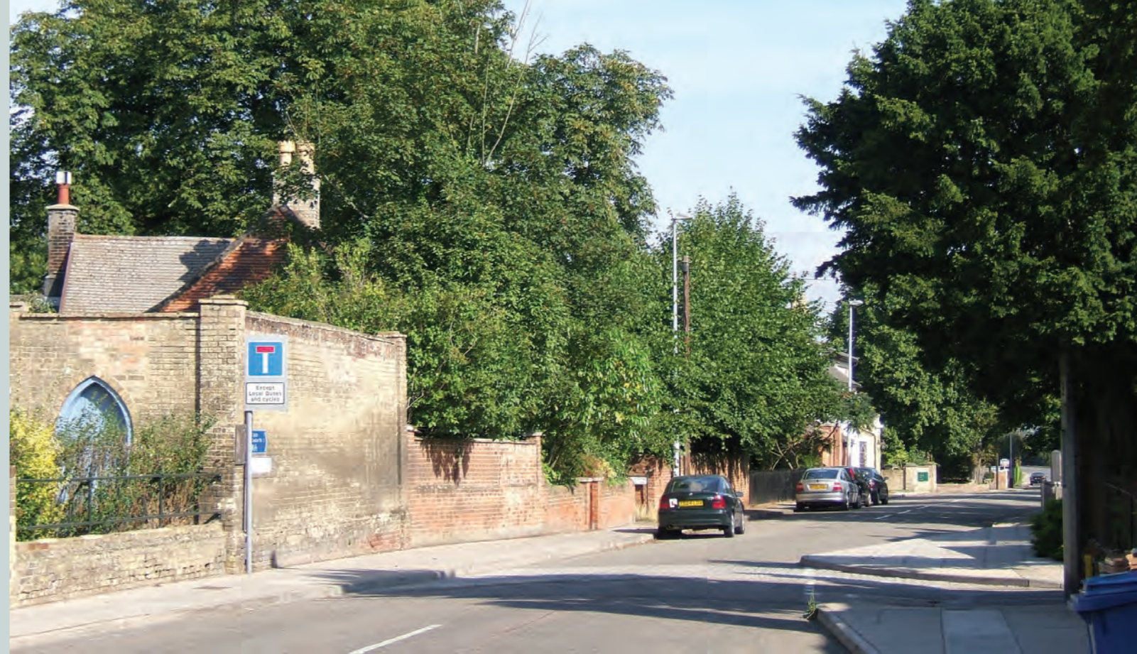
View of Old Norwich Road