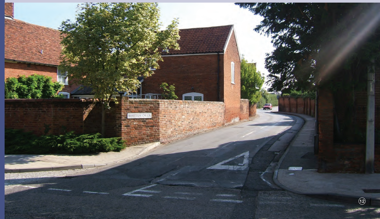
Whitton Church Lane

The area presently lacks any traditional paving surfaces of interest (except the modern slab paving of Whitton Church Lane. The in-situ concrete and tarmac paths have been the subject of frequent ill-matching reinstatement. There are also numerous concrete pavement crossings. Minor environmental enhancement in the form of materials and a change of traffic priorities was carried out at the junction to Whitton Church Lane in 2003.