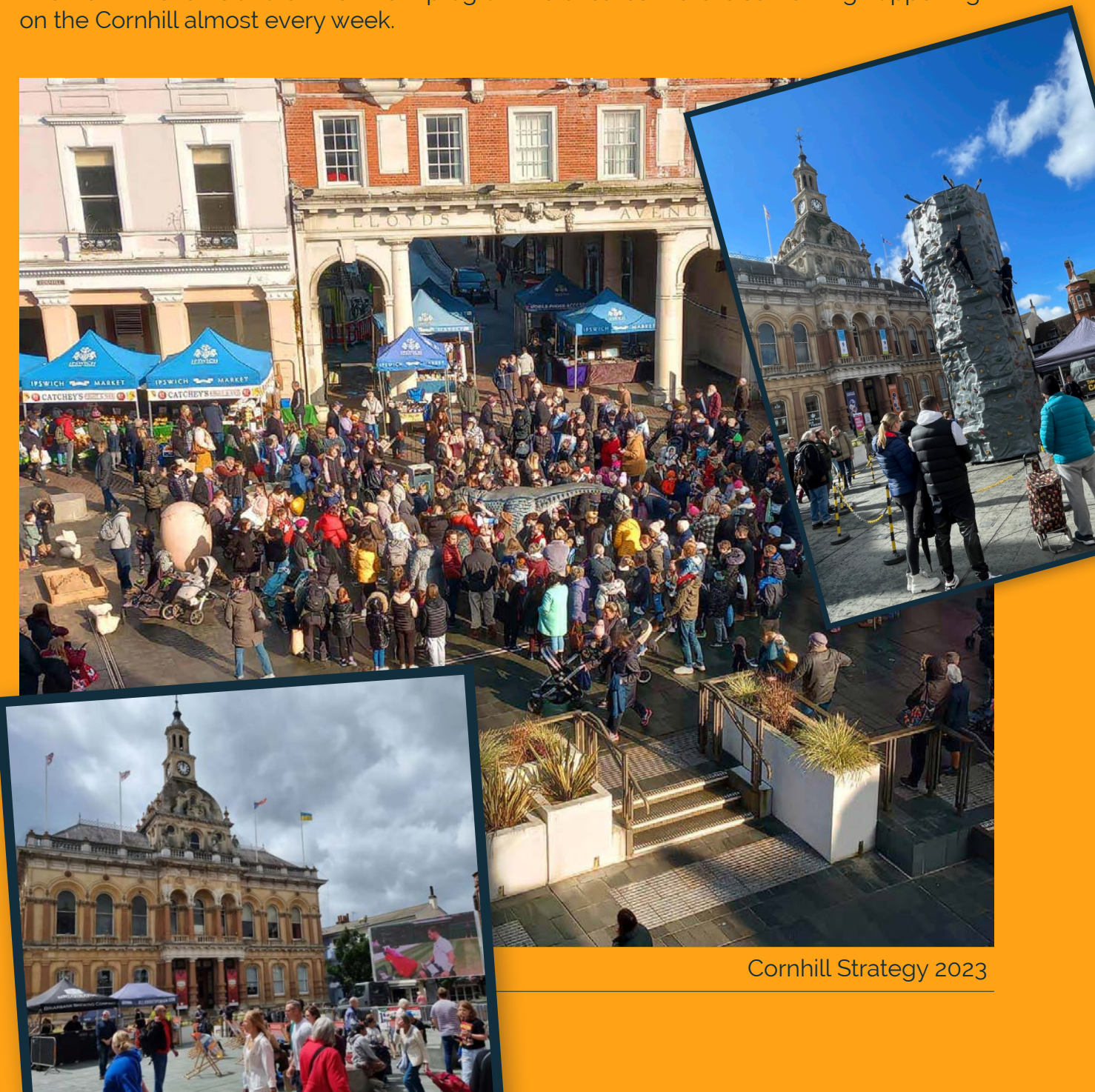
Cornhill Strategy 2023

The Cornhill events and enlivenment programme ensures there is something happening on the Cornhill almost every week.