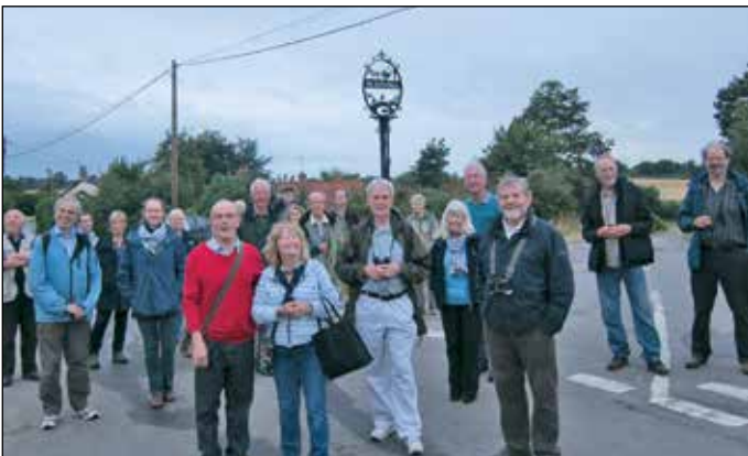
Save Our Suffolk Swifts group in Blaxhall

last year, this year the project has continued to expand and develop with a further two events at Lower Layham and Blaxhall.