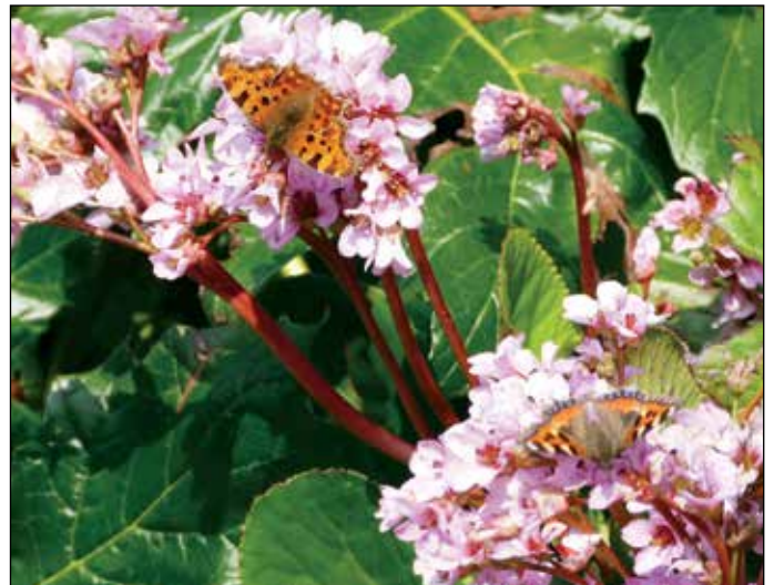
Comma on the left and small tortoiseshell on the right

Many of these birds nest near the ground so dog walkers are asked to prevent their dogs running through the woodland areas during the bird nesting season (1st March to 31st July). The pockets of woodland and scrub are regularly coppiced to ensure there are sunny glades for insects and thick, bushy growth for nesting birds. How good would it be if we could get Nightingales to stay and breed instead of just passing through on migration?!