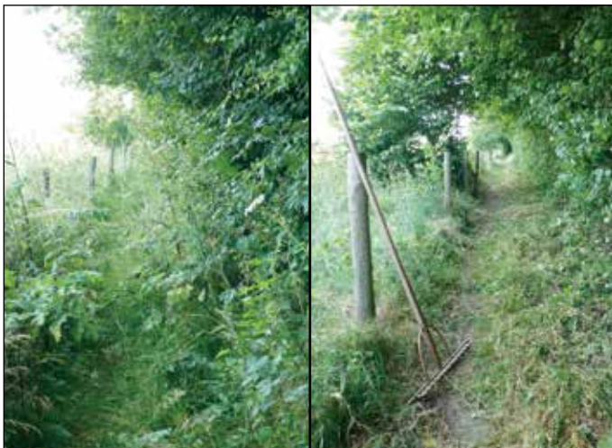
The somewhat overgrown pathway. . . now cleared and easily accessible

In May, the Friends were helping at the very successful Spring Wood Day organised by Greenways and attended by hundreds of local people. The wood echoed to the sounds of pole lathes and other woodland crafts, music, dancing and happy children. The bluebells were looking lovely and we were able to encourage quite a few people to join our Friends group.