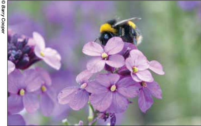
White-tailed bumblebee on Erysium – Bowles mauve wallflower

At 8 o'clock on a sunny morning in May a full coach left Crown Street bound for Wakehurst Place in Sussex, Kew Garden's 465 acre 'country estate'.