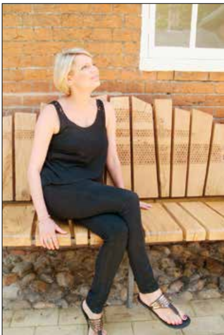
The new bench in the Stable Block, using recycled Holywells Park oak, funded by SCC and private donation.

And what have we achieved so far? To start, the Friends have always been clear that as far as possible, the restoration should be sensitive to environmental issues and increase the environmental value of Holywells Park. The Stable Block now possesses a café, complete with a screen showing views from wildlife cameras in the park. An adjacent reception area allows visitors to learn more about Holywells Park, its facilities,