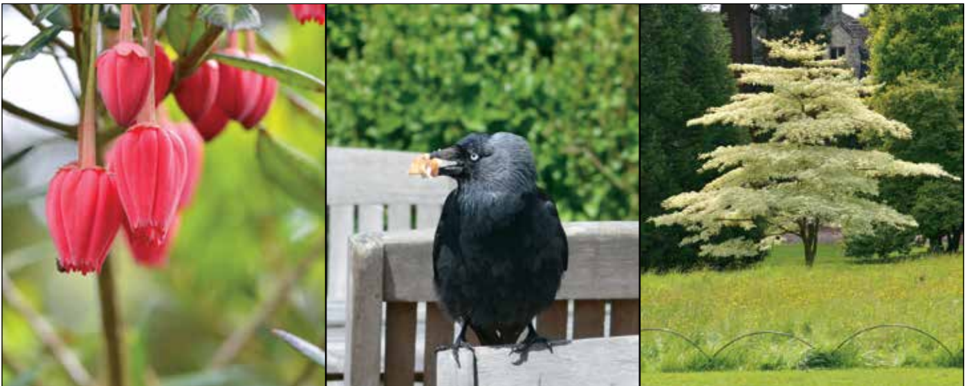
More members photographs from Wakehurst Place

James is manager of the Greenways Countryside Project. With the aid of a band of volunteers Greenways protects and enhances the 100 square kilometres in and around Ipswich for the benefit of wildlife and people. Amongst other things they clear our footpaths and clean out our ditches. Their latest project is to encourage wildlife into our built-up areas by getting us all to provide something in our gardens so that wildlife corridors can exist in our towns. Come along and see what you can do to improve our urban space and your own garden for wildlife.