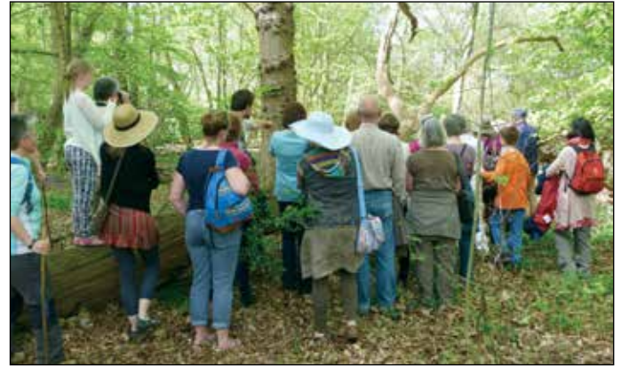
Discovering butterflies on a guided walk in Spring Wood

through the bluebells and other wildflowers. Our 'megabash' practical events have also continued to be a success, with volunteers from different groups coming together to make an impact on larger tasks – each year these are held in Belstead Brook Park, Purdis Heath and Martlesham Heath, and typically attract around 30-60 volunteers. Other public events have included guided walks and 'Wildlife Homes' activities (see details in case studies).