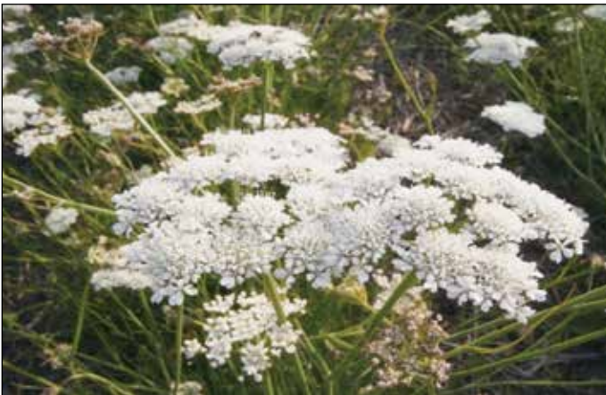
Oenanthe pimpellinoides – corky-fruited water dropwort

My first delight was the quirkily-named corky-fruited water dropwort – supposedly scarce, but there is a large thriving patch near the park entrance. Peter told us some of the history of Bourne Park: a former boating lake is now part of the reed-beds, and non-native trees planted decades ago are now mature amongst native trees. We looked at horse chestnuts affected by leaf miners and so understood why many of their leaves turn brown later in the season.