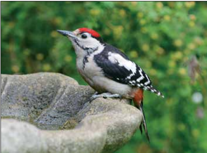
Great spotted woodpecker

We've had an abundance of birds this year some of whom can only be identified by their song as they hide very successfully deep in the undergrowth. These have included Willow Warbler, Common Whitethroat, Bullfinch, Dunnock, Blackbird, Song Thrush, Mistle Thrush, Carrion Crow, Magpie, Jay, Robin, Blackcap, Goldfinch, Moorhen, Common Buzzard, Great Spotted Woodpecker, Green Woodpecker, Grey Heron, Blue Tit, Great Tit, Long Tailed Tit, Coal Tit, Chiffchaff and Chaffinch. A pair of nesting Sparrowhawk is a good indication that the population of small birds is big enough to support her family and therefore the area of habitat is in good condition.