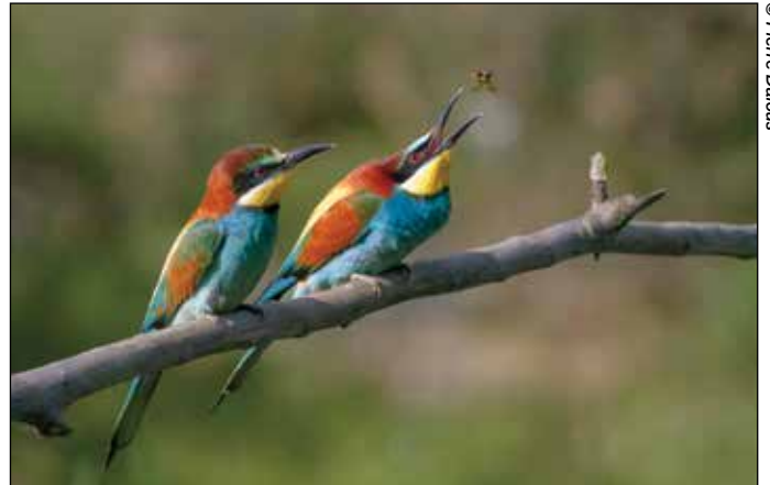
Exotic Suffolk visitors - Bee-eaters (Merops apiaster)

Issued quite without ceremony or media attention came the latest DEFRA publication on 23rd July. 'England Natural Environment Indicators' made for sober reading for those of us with an interest in nature. It confirmed for example that the official projected trend for our breeding farmland butterflies and birds continues to deteriorate in both short and long term. Under DEFRA's own definition 'Deteriorating' meaning an anticipated decline in excess of 50% over the next 25 years,