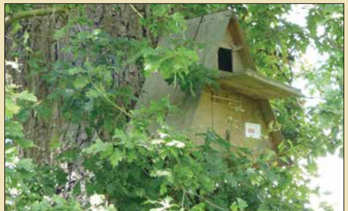
Suffolk community barn owl project - SOG meeting 23rd September