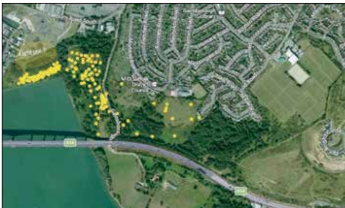
Map showing the location of Glow-worm sightings (yellow spots) across the Orwell Country Park (16th-19th) June

Surveys for females were conducted between the 16th and the 19th of June across Piper's Vale and the accumulative locations were plotted on a map.