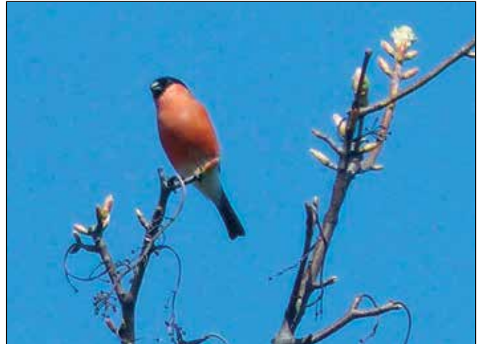
A handsome male Bullfinch – you can't beat a bit of bully!

Many of these birds nest near the ground so dog walkers are asked to prevent their dogs running through the woodland areas during the bird nesting season (1st March to 31st July). The pockets of woodland and scrub are regularly coppiced to ensure there are sunny glades for insects and thick, bushy growth for nesting birds. How good would it be if we could get Nightingales to stay and breed instead of just passing through on migration?!