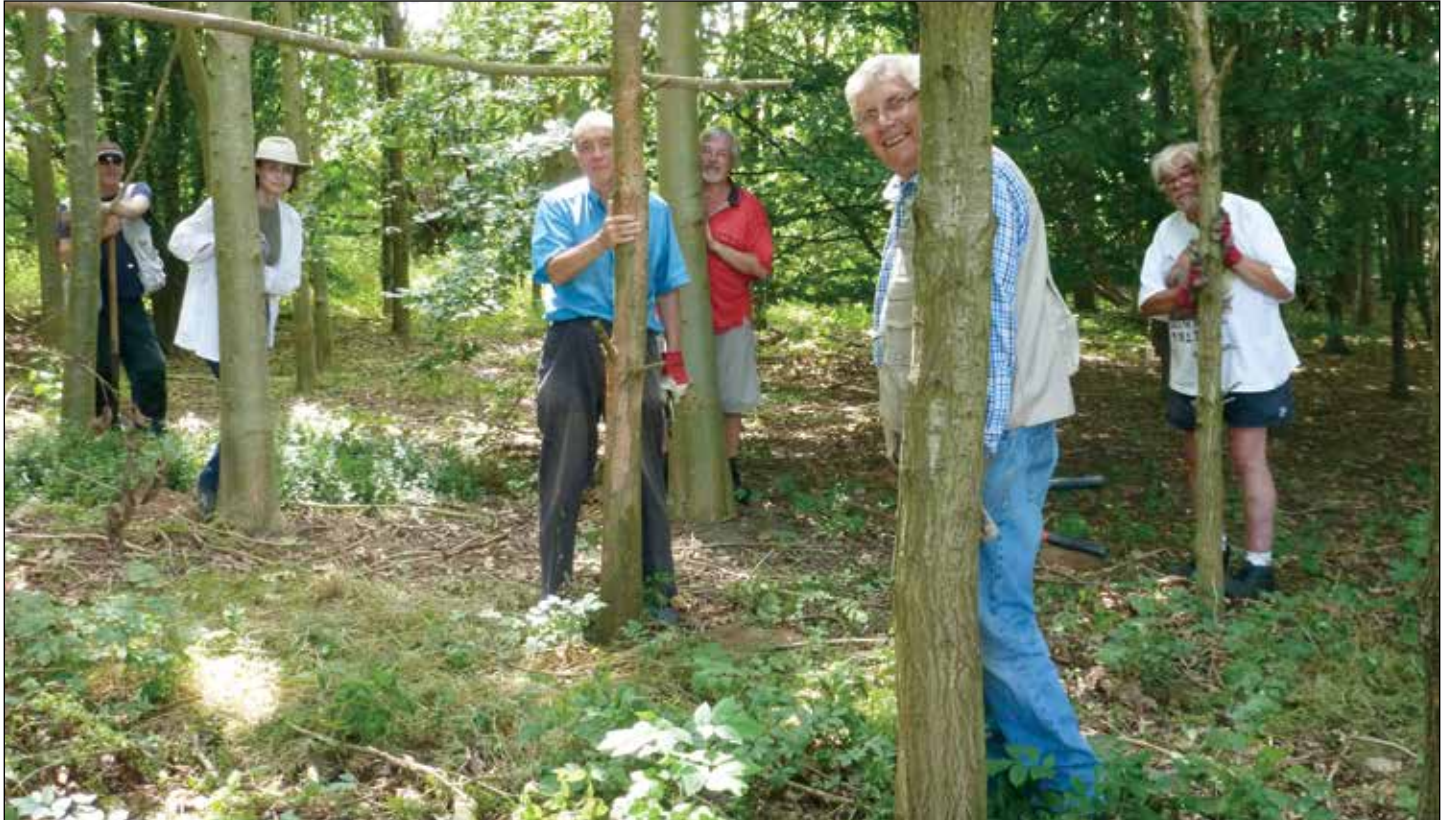
The Friends at work - and play!

Friends of Belstead Brook Park (FoBBP) was set up in 2002 to help look after the 250 acres of informal country park on the south-western fringe of Ipswich. The group runs practical work parties, helps raise funds for improvements and acts as 'eyes and ears', passing information back to the Greenways Project.