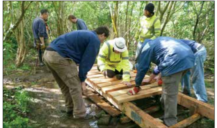
Volunteers building a boardwalk under supervision

Routine maintenance of our 50 or so sites includes: coppicing and woodland management; tree and hedge planting; heathland scrub clearing; meadow mowing and raking;