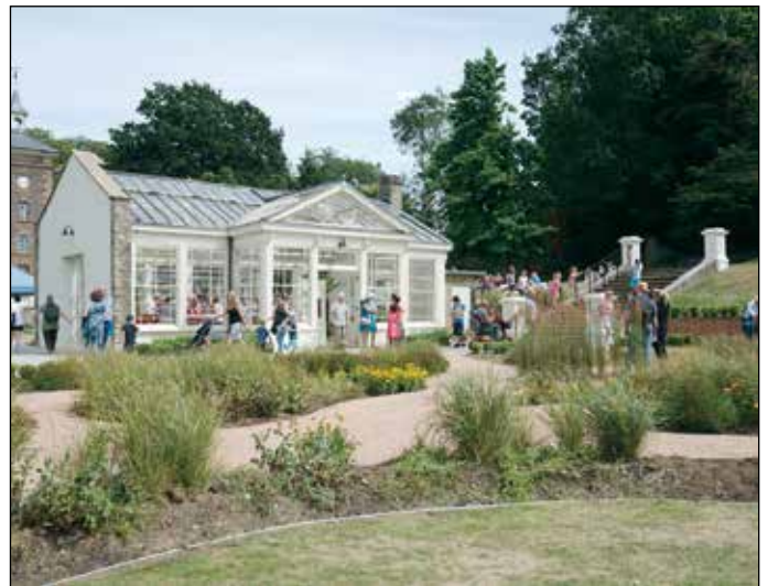
The Orangery, from the centre of the new maze

Further along, the new performance area sits between the Stable Block and Orangery. The Orangery has been restored and is being slowly transformed. Already there is a palm tree planted inside the terracotta feature. The Orangery has already hosted various events, including launch meetings for Suffolk Wildlife Trust and the Lottery-funded 'Closer to nature in Ipswich' project. A great deal more has been done, including a new low-height sensory maze, complete with bench in the centre.