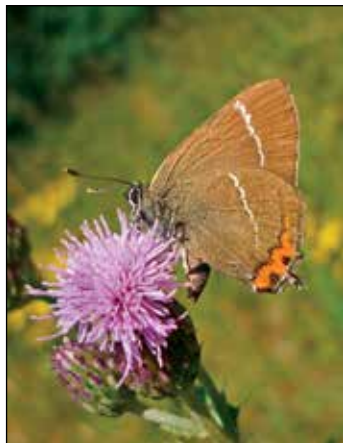
White Letter Hairstreak

Up through the woodland, we found White Letter Hairstreak (hard to find) and Speckled Wood. We returned along the top of the flower bank, and admired the cornfield annuals which the IBC rangers had sown earlier in the year. We then visited Pipers Vale, where a quick investigation of the heathland produced two Silver-studded Blues. Later, Purple Hairstreak was seen on the oaks. In total 19 species of butterfly were seen.