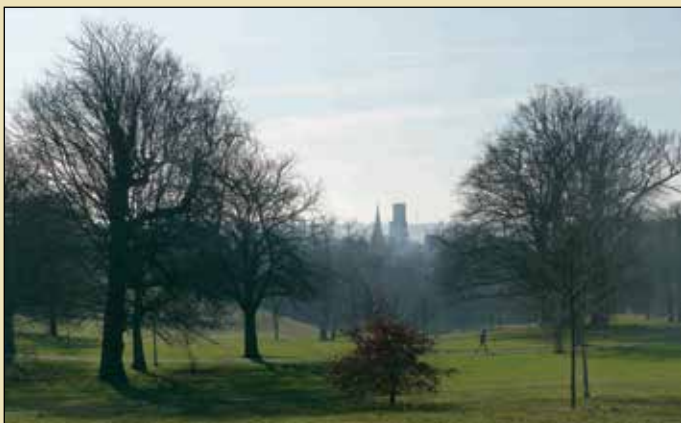
RSPB midweek walk Christchurch Park - 15th December