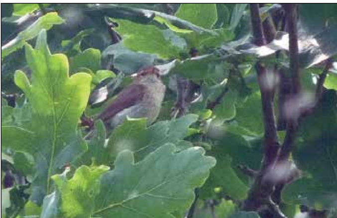
A chiffchaff calling from the undergrowth

We've had an abundance of birds this year some of whom can only be identified by their song as they hide very successfully deep in the undergrowth. These have included Willow Warbler, Common Whitethroat, Bullfinch, Dunnock, Blackbird, Song Thrush, Mistle Thrush, Carrion Crow, Magpie, Jay, Robin, Blackcap, Goldfinch, Moorhen, Common Buzzard, Great Spotted Woodpecker, Green Woodpecker, Grey Heron, Blue Tit, Great Tit, Long Tailed Tit, Coal Tit, Chiffchaff and Chaffinch. A pair of nesting Sparrowhawk is a good indication that the population of small birds is big enough to support her family and therefore the area of habitat is in good condition.