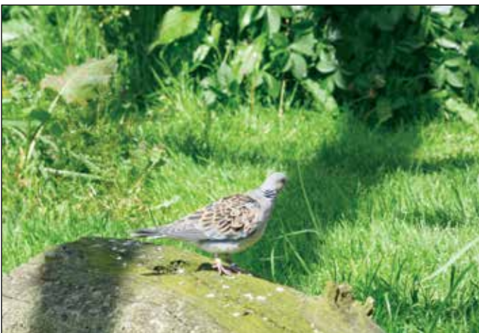
Turtle dove - no longer a routine sight