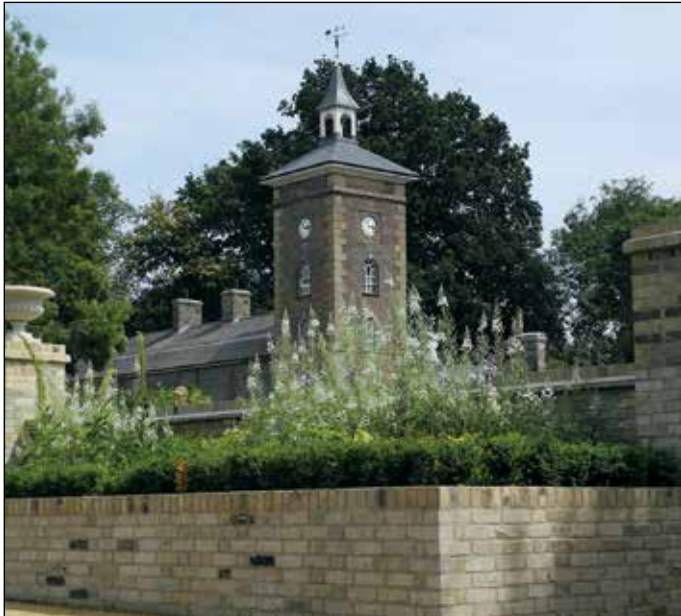
The Stable Block as seen from the terrace

Holywells Park was officially re-opened on the 18th July. The Grand Re-opening represented the completion of the capital works of the restoration project. The project itself runs for another three years or so, to encourage increased use of the park.