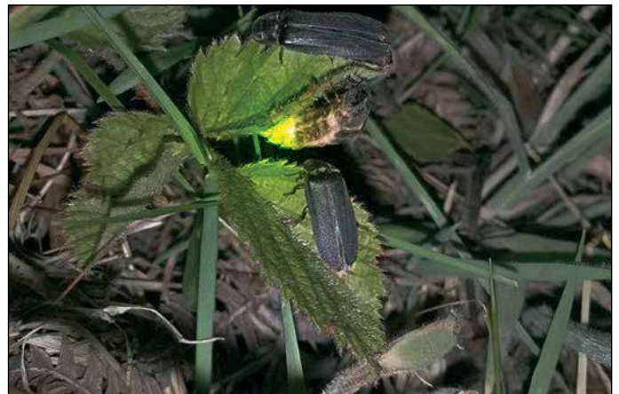
Female enticing two males (Pipers Vale)

The study showed that a good mixture of bare ground, short vegetation and scrub, i.e. well managed areas, were favoured. Sparsely vegetated bracken was noted to be a favoured display point for the females, who would climb up the strands. In areas of very short, rabbit grazed vegetation, retained dead wood and fence posts were used as display points. One discovery was to find glow-worms displaying on recently created heather areas.