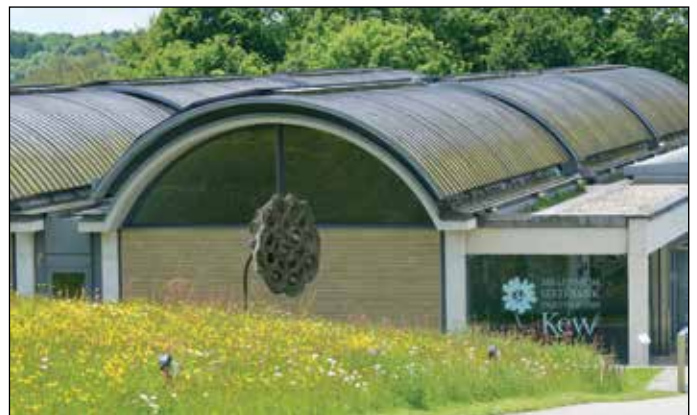
The Millennium Seedbank

The Seed Bank was formally opened in 2000, the world's largest ex situ plant conservation project. It is a 5,500 sq. meter low-level building with barrel-vaulted roofing with solar panels which generate enough renewable energy to power the whole Seed Bank operation. It stores seeds from almost all the UK's native plant species and aims to conserve 25% of the world's plant species by 2020.