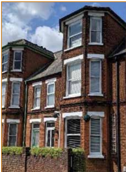
Pair of red brick semi-detached dwellings located on high ground at the eastern end of Ashmere Grove. Unusual three storey scale, with the height of