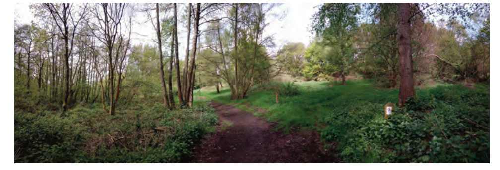
Pictures clockwise from from top left: Gainsborough Community Library, Fletcher Road, All Hallows Church, Braziers Wood, Boyton Road